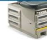
Tables - Exam