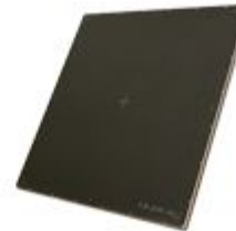
X-Ray - Digital Panels

All product and company names are trademarks of their respective holders. Use of them does not imply any affiliation with or endorsement or sponsorship by them.