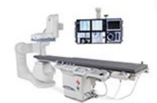
Cath Lab / Angio