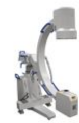
C-Arm - Fluoroscopy Machines