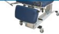
Tables - Ultrasound