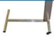
Tables - Overbed