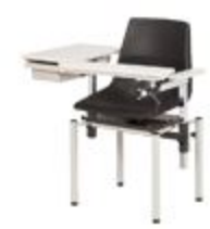
Blood Drawing Chairs