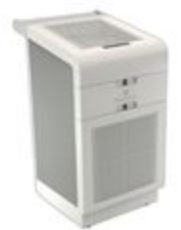
Medical Air Filtration Systems