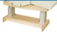
Tables - Spa