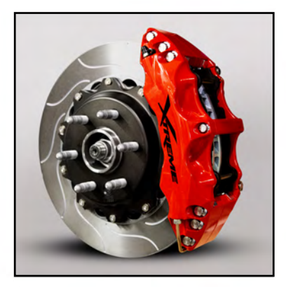
Optional High performance brake upgrade including 6-piston forged front calipers (red with black XTREME lettering and two-piece 13.6" slotted front rotors, rear factory calipers painted red.

To provide an aggressive low-rider look, the 2020 XTREME™ features our standard sport suspension system that lowers the truck 2" in front and 5" in the rear, and includes higher-rated front and rear performance shocks.