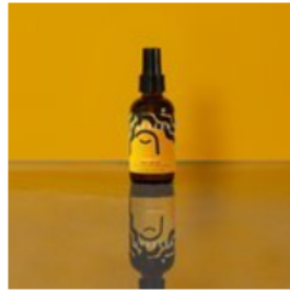
jojoba oil hair serum