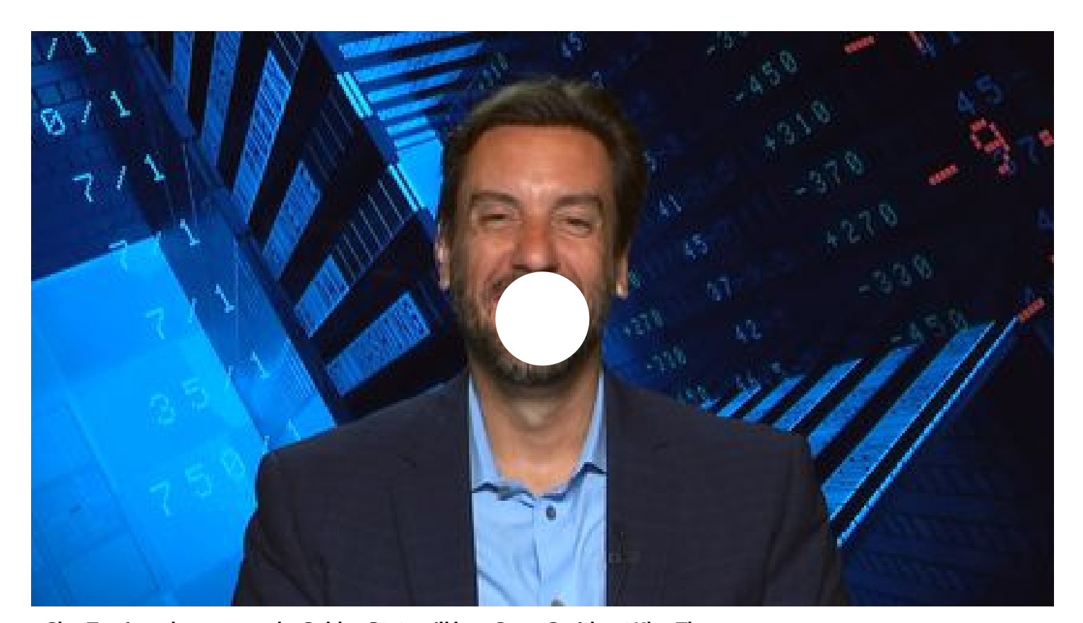
Clay Travis makes a case why Golden State will lose Game 3 without Klay Thompson