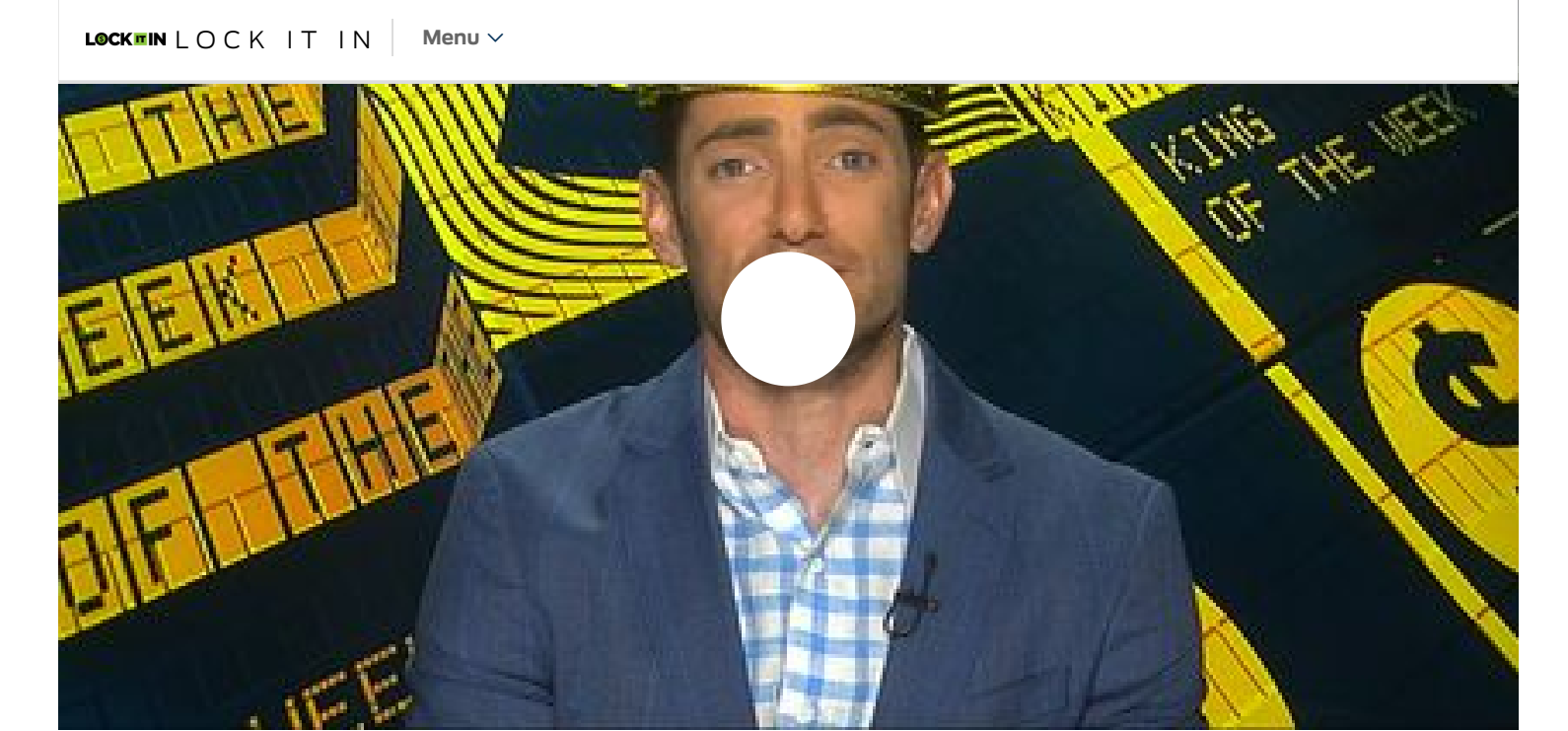
Todd Fuhrman: Kawhi Leonard is the biggest concern for Toronto ahead of Game 3