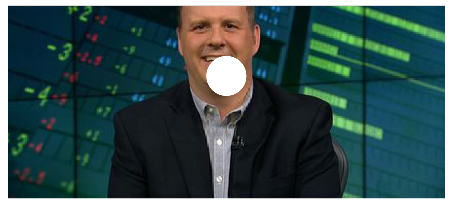
Cousin Sal likes Golden State to win Pro Basketball Championship in 6 games