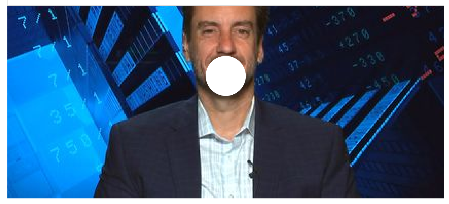
Clay Travis predicts a lopsided win for Milwaukee tonight against Toronto