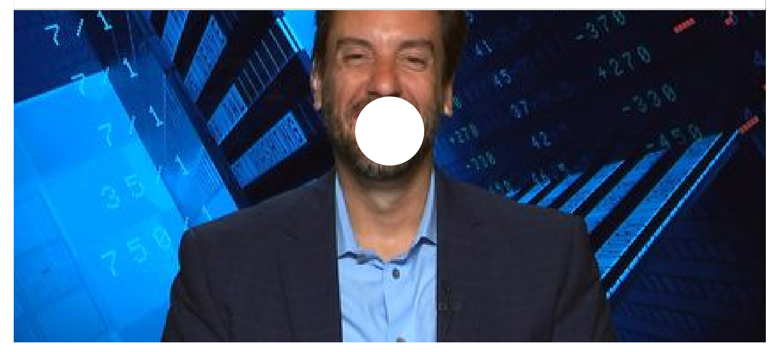
Clay Travis makes a case why Golden State will lose Game 3 without Klay Thompson