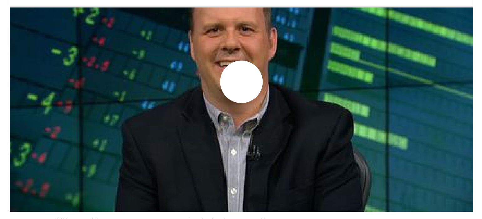
Cousin Sal likes Golden State to win Pro Basketball Championship in 6 games