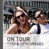
ON TOUR 11TH & 12TH GRADES