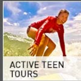
ACTIVE TEEN TOURS