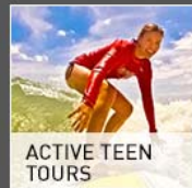
ACTIVE TEEN TOURS