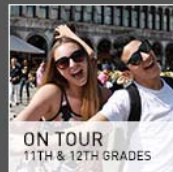
ON TOUR 11TH & 12TH GRADES