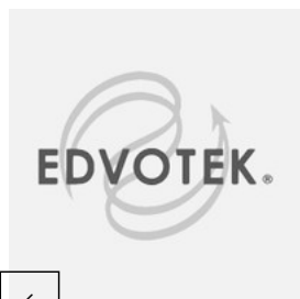
636-B - Yellow Micropipet Tips Bulk (1 - 200 µl / Bag of 1000 Tips) (/636-B)