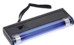
969 - Long Wave UV Light (/969)