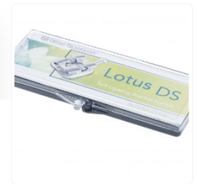
Lotus Plus DS, Interactive, Patient Kits - Ortho Technology's version of ROTH Rx. $204.49