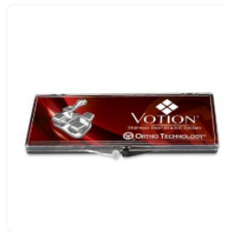
Votion Metal Brackets Roth Single Patient Kits 5x5 $86.79