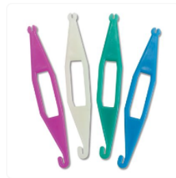
Creatures of the Sea Elastic Directors $31.79