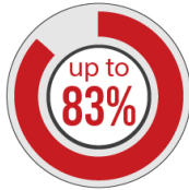
Average savings with NCTC IP Transit

Our Group Purchasing organization frees up your time so that you can focus on business growth. We create platforms and solutions that equip our members to deliver the best video and broadband experience to their customers. We extend the reach of our suppliers' sales and marketing efforts, while providing operational efficiencies.