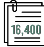
Average # of Sales Orders fulfilled in a year