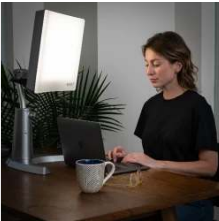
BRIGHT LIGHT THERAPY