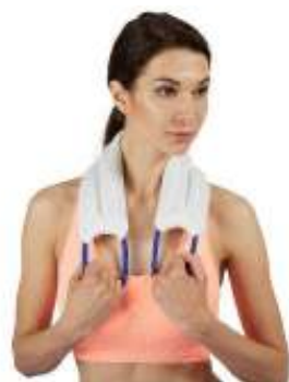
BED BUDDY HOT & COLD WRAP