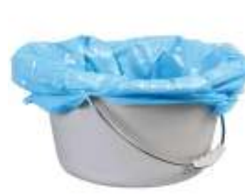
CAREX COMMODE LINER (7, 24, 48, 72 PACK)