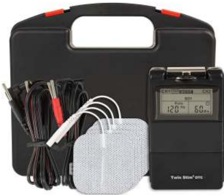
TWIN STIM TENS UNIT AND EMS MUSCLE STIMULATOR