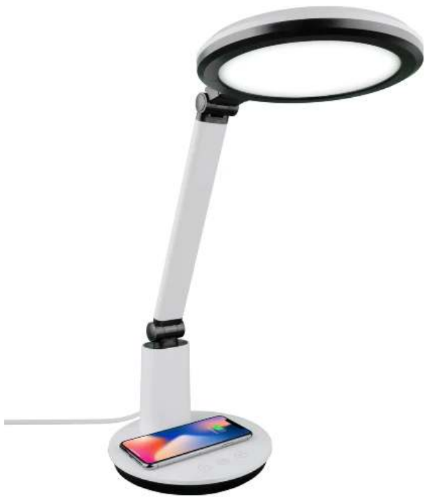
THERALITE HALO BRIGHT LIGHT THERAPY LAMP