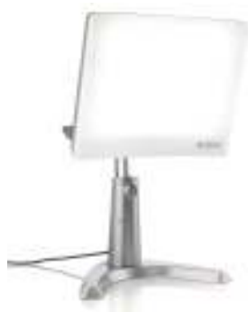
CAREX DAY-LIGHT CLASSIC PLUS LIGHT THERAPY LAMP