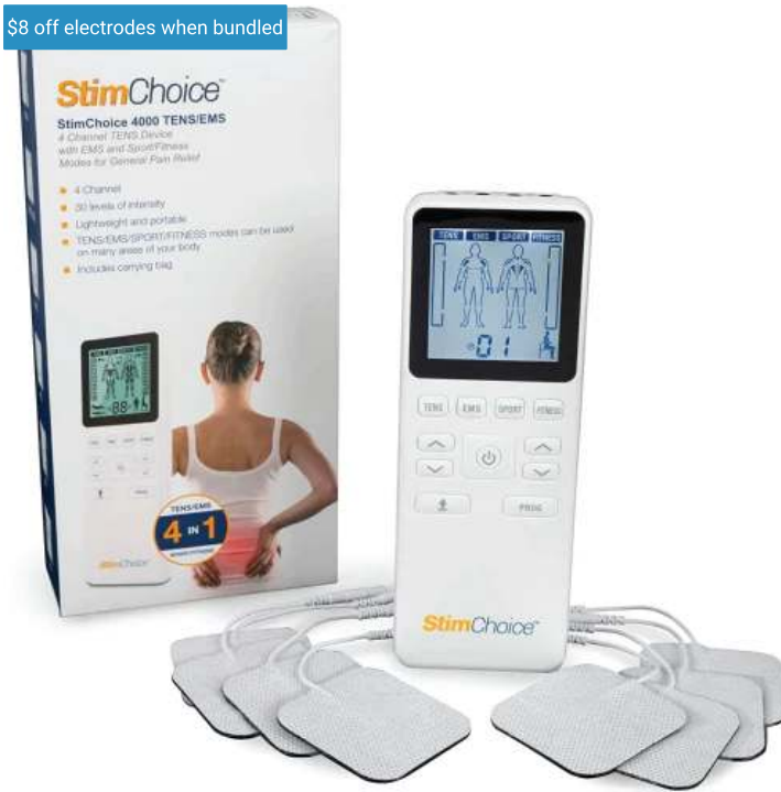
STIMCHOICE 4000 TENS UNIT AND EMS MUSCLE STIMULATOR