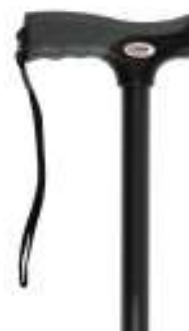
CAREX SOFT GRIP DERBY CANE