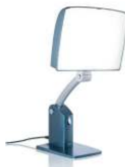
CAREX DAY-LIGHT SKY LIGHT THERAPY LAMP