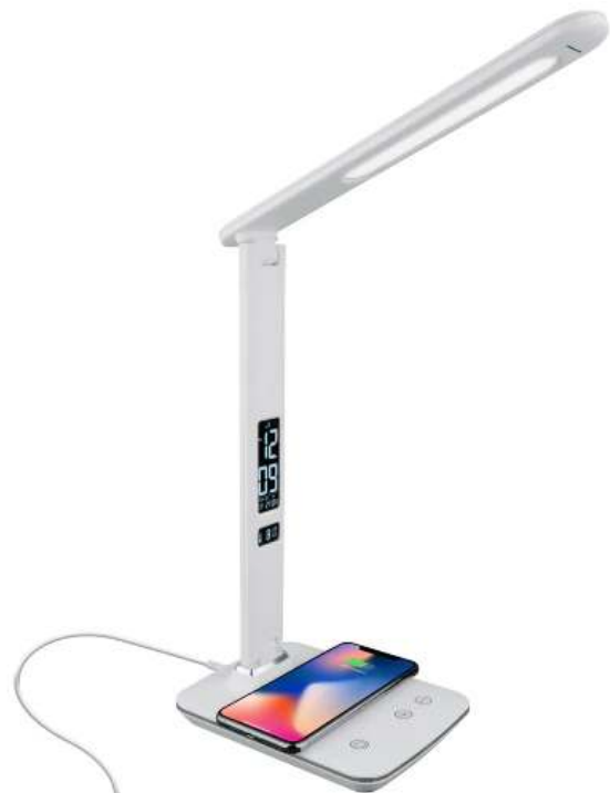
THERALITE RADIANCE LIGHT THERAPY LAMP