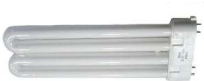
CAREX REPLACEMENT BULB FOR DAY-LIGHT CLASSIC/CLASSIC PLUS, SUNLITE