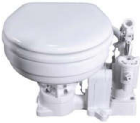
PH Powerflush $935.00 | View more