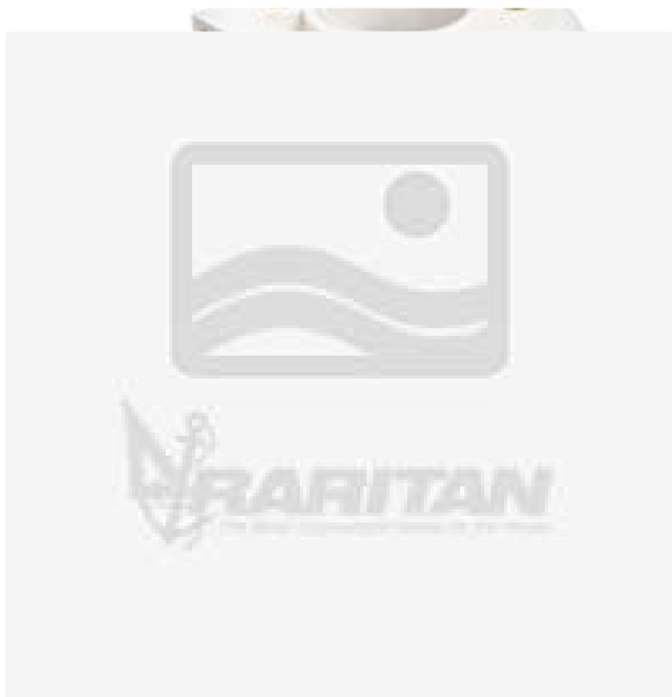
SeaEra Base $80.00 | View more