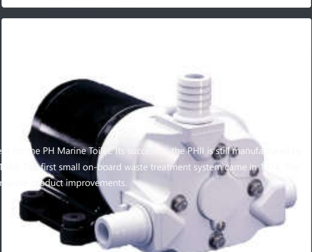
SeaEra Conversion Kit $985.00 | View more