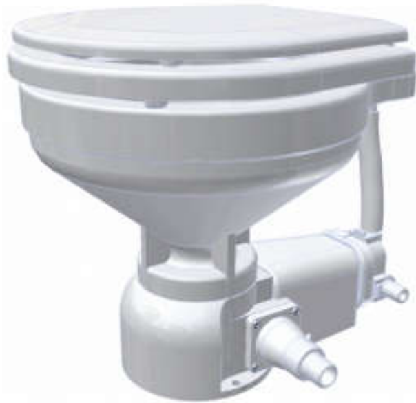
SeaEra $900.00 | View more