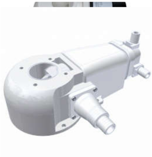
SeaEra Base Assembly without pump $398.00 | View more