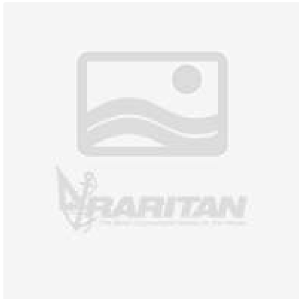
SeaEra 12V Conversion $780.00 | View more