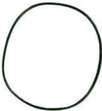
SeaEra O-Ring $3.00 | View more