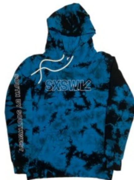
TIE DYE LOGO HOODIE