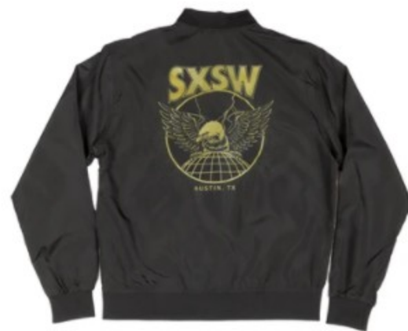
EAGLE BOMBER JACKET