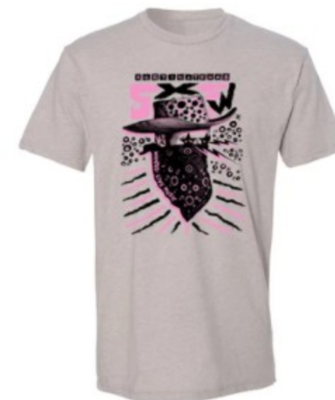
WANTED: LIVE MUSIC TEE