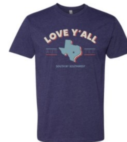
LOVE Y'ALL TEE