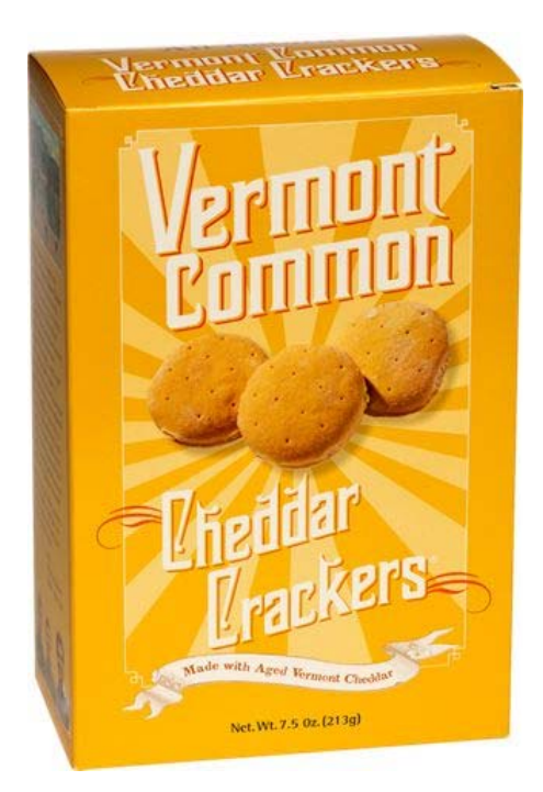
VIEW LARGER > Rollover Photo to Zoom

Home > Food > Baked Goods > Cookies and Crackers