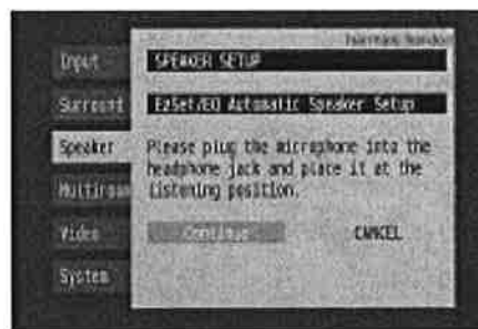
Figure 53 – EzSet/EQ Screen

Select the "Auto Configuration" setting, and the screen shown in Figure 53 will appear to direct you to plug the EzSet/EQ microphone into the Headphone Jack.