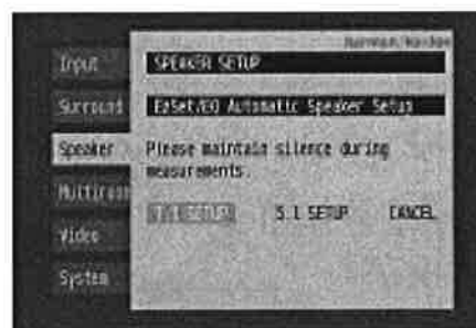
Figure 54 – EzSet/EQ: Number of Speakers

Step Four – After you select "Continue," the screen shown in Figure 54 will appear. Although the AVR 347 may be used with up to eight speakers, you may have elected not to install surround back speakers at this time, or you may have decided to use the surround back speaker channels to power speakers in the remote room of a multiroom system. This screen directs you to program EzSet/EQ for a 5.1- or 7.1-channel configuration. Select the setting that reflects the number of speakers installed in your system, and EzSet/EQ will do the rest automatically!