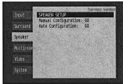
Figure 52 – Speaker Setup Menu Screen

Step Three – Make sure that the AVR 347 and the video display are turned on. Press the OSD Button to display the Menu System. See Figure 48. Use the ▲/▼ Buttons to move the cursor to the Speaker Setup tab, and then press the Set Button to select the Speaker Setup menu. See Figure 52.