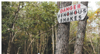
A warning is nailed high in a pair of trees on the nature trail at the Socastee Recreation Park.

A day after wrapping up a three-week remodeling job, Tom Housner traded his tools for a