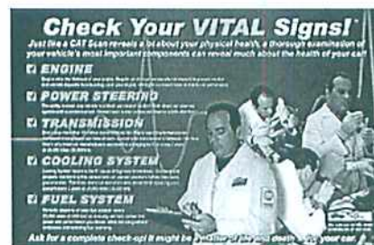
"Vital Signs" Sales Storyboard

Click an image below to view a larger image of some of the Vital Signs point-of-sale materials: