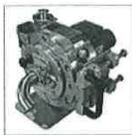
10 And Conjet16 High-Density Bed Jet Mills