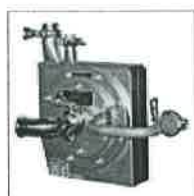
Condux High-Efficiency Fine Classifiers