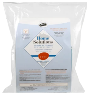
(Style P) 12 Pack Home Solutions Synthetic Filter Bags