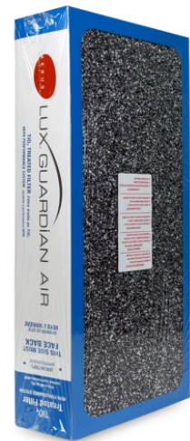
Guardian Air HEPA Filter