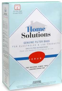
(Style C) Home Solutions™ Genuine Filter Bags