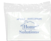
(Style C) Canister Cleaners After Filters