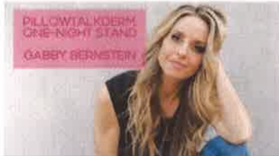
Pillowtalkderm One-Night Stand with Gabby Bernstein