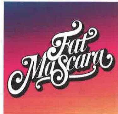
Ep. 139: All About Eyes I hit the day running at 6:45 a.m. because that's when my baby gets up. I shower and get dressed while interweaving my baby's schedule with my own. At 8:30 a.m. my nanny