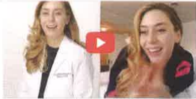
A Dermatologist's Entire Routine, from Waking Up to Skincare Work It Allure