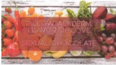
Pillowtalkderm Flavor of Love... Sexual Chocolate