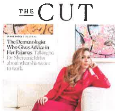
The Dermatologist Who Gives Advice in Her Pajamas After graduating from George Washington University, where she completed a seven-year

A few pinch me moments as I never thought I would have the spot light on me but since they happened, I'm excited to share them with you!