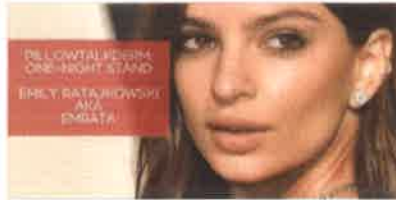
Pillowtalkderm One-Night Stand with Emily Ratajowski aka Emrata