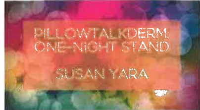
Pillowtalkderm One-Night Stand with Susan Yara