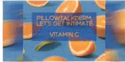
Pillowtalkderm Let's Get Intimate... Vitamin C