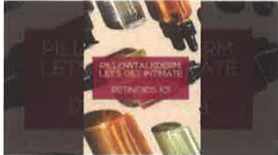
Pillowtalkderm Let's Get Intimate... Retinoids 101