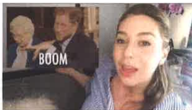
#PillowTalkDerm: how to layer your skincare products