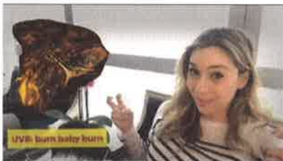
#PillowTalkDerm: Sunscreens 101