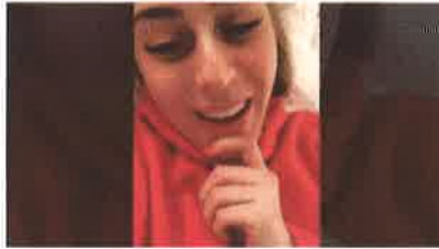
Pillowtalkderm: becoming a dermatologist