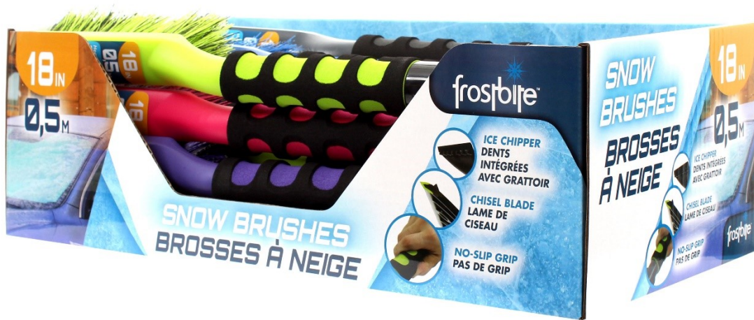
Exhibit B: Illustrative Product Display