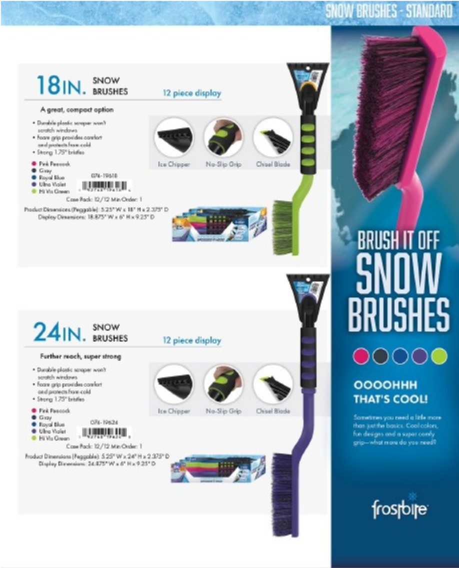
Exhibit A2: Illustrative Interior Catalog Page Displaying Product