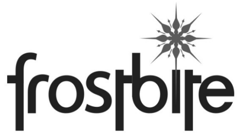
Exhibit C: Applicant's Mark