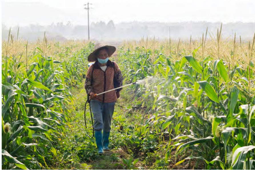
PESTICIDE USE IN CHINA

Most arginine is made in China by fermenting corn in big tanks with specific bacteria that transform the corn sugar into arginine. Then they take the arginine and add an enzyme reaction to make citrulline.