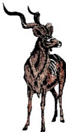
Illustration of kudu

also : a related antelope ( T. imberbis )