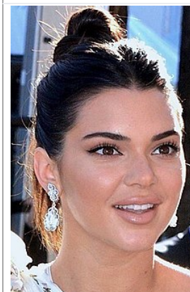
Jenner in May 2017