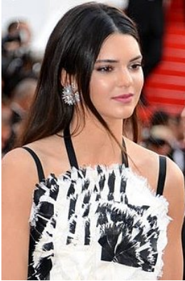
Kendall Jenner at the 2014 Cannes Film Festival