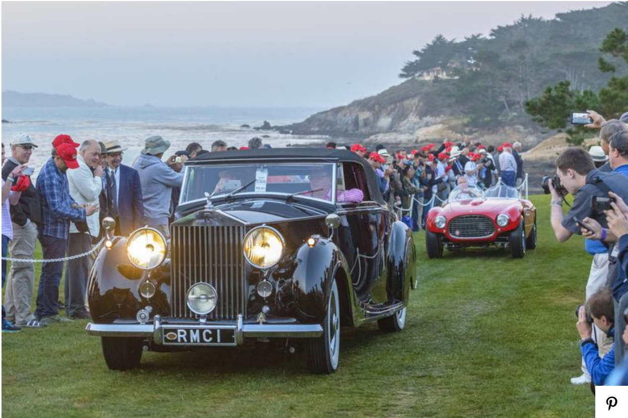
WHAT DAWN PATROL LOOKS LIKE AFTER THE HATS HAVE BEEN DISTRIBUTED AND THE SUN HAS RISEN.

ago the company added to its offerings the now coveted Dawn Patrol Hats, red badges of honor handed out to the lucky few who are the first on the field.