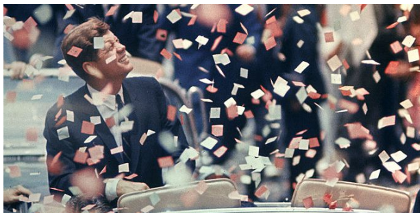
What Even Is a Ticker-Tape Parade?