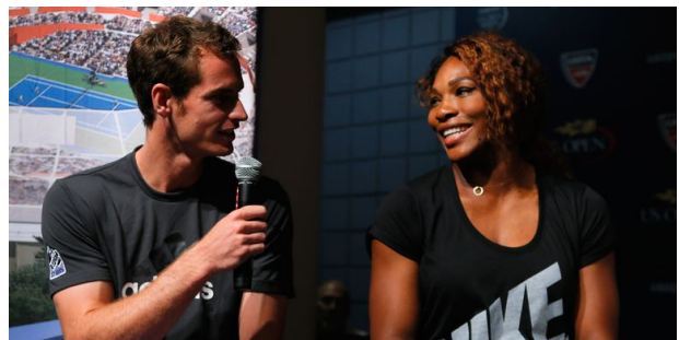
Serena Williams Will Play Doubles with Andy Murray