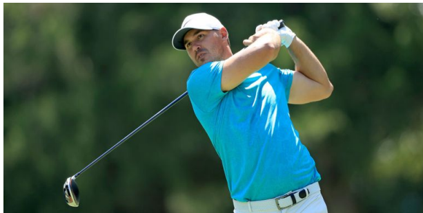
Top 10 PGA Tour Money Leaders

The U.S. Women's National Soccer Team Victory Parade and City Hall Ceremony