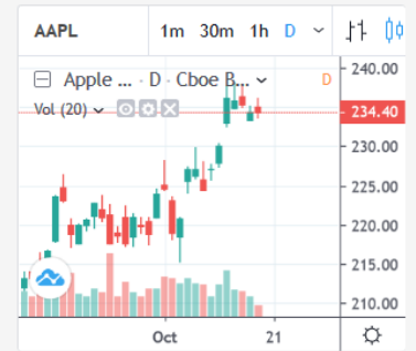
AAPL Chart by TradingView