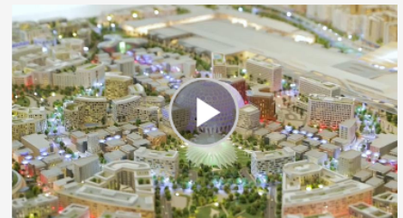
Expo 2020: A year to go