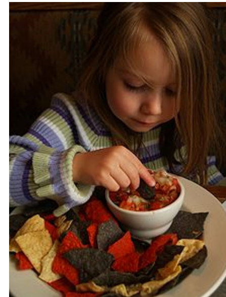
A young girl eating tortilla chips with pico de gallo