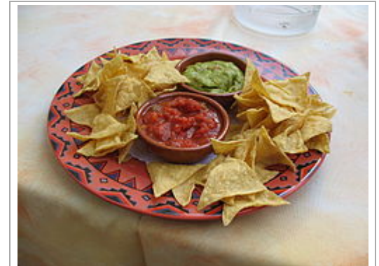
A plate of tortilla chips with salsa and guacamole