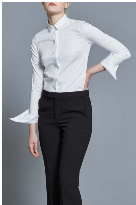
AL02 SHIRT 148,00 €