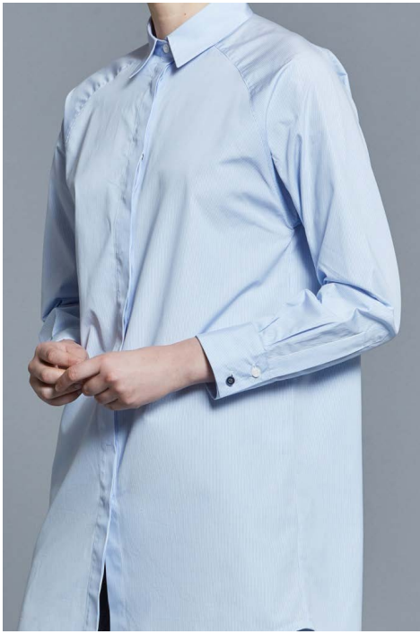
AL04 OVERSHIRT 199,00 €