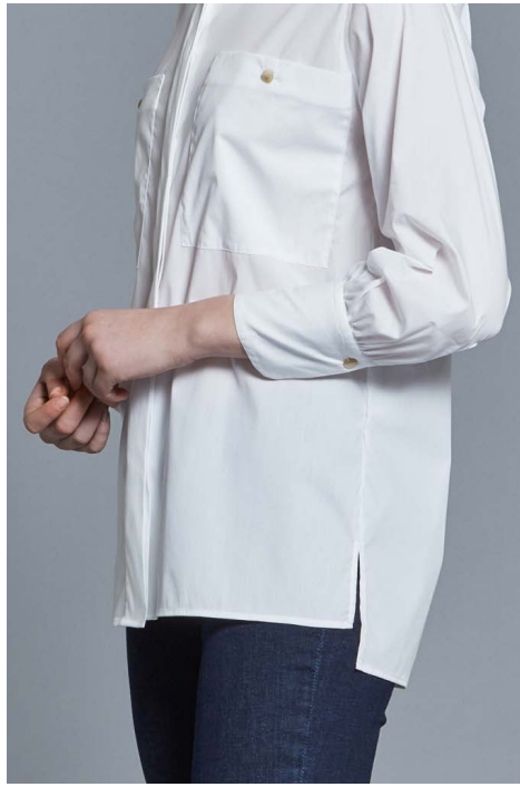
AL05 SHIRT 199,00 €