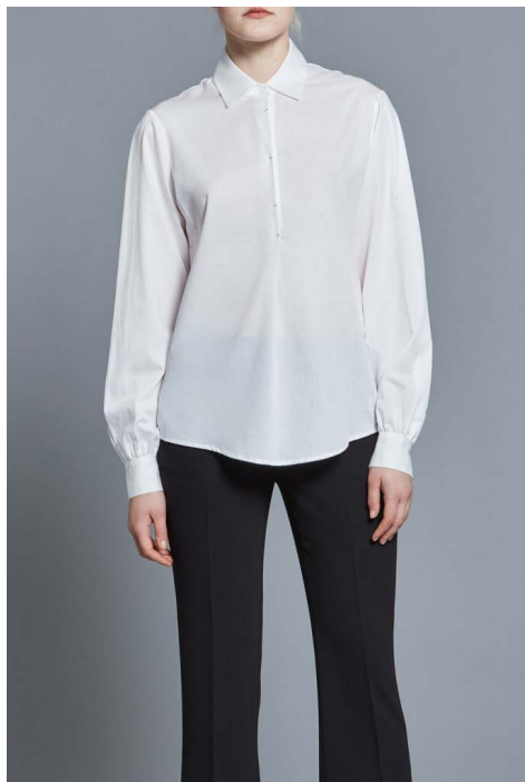
AL01 BLOUSE 139,00 €