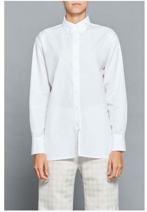
SHOP AL06 SHIRT 169,40 €