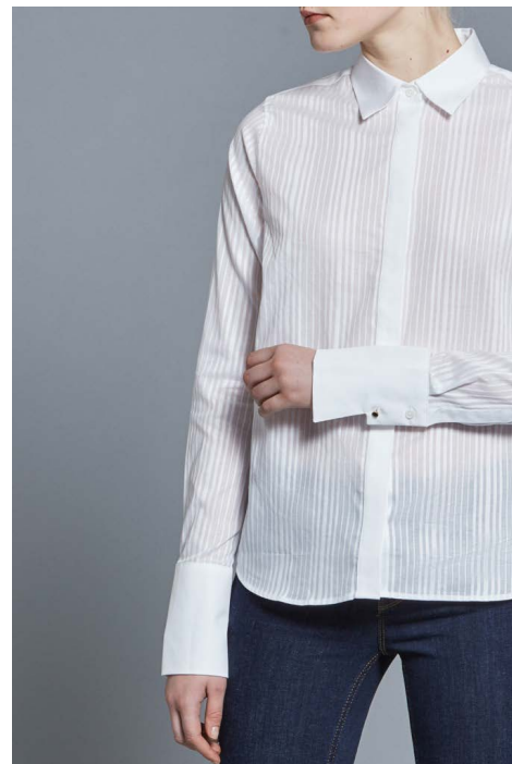
AL03 SHIRT 139,00 €