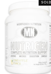
NUTRIGEN - Complete Nutrition Support $48.00