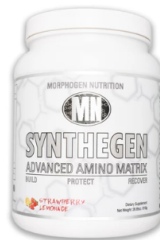
SYNTHEGEN - Advanced Amino Matrix $48.00