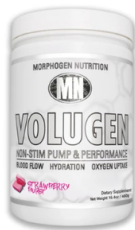
VOLUGEN® - Non-stim Pump & Performance $48.00