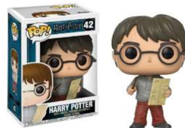
Harry Potter with Marauder's Map Funko Pop! Vinyl Figure