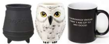
Harry Potter Mischief Managed™ Transforming Mug, Hedwig Mug, and Cauldron Coffee Mug Set