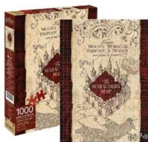
Marauder's Map 1,000 Piece Puzzle