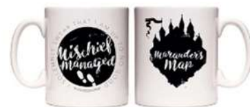
Harry Potter Mischief Managed / Marauder's Map Mug