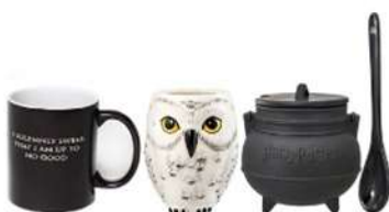
Harry Potter Mischief Managed™ Transforming Mug, Hedwig Mug, and Cauldron Soup Mug Set