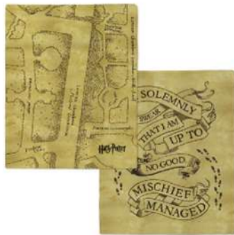
Marauder's Map/1 Solemnly Swear That I Am up to No Good™ Fleece Throw Blanket