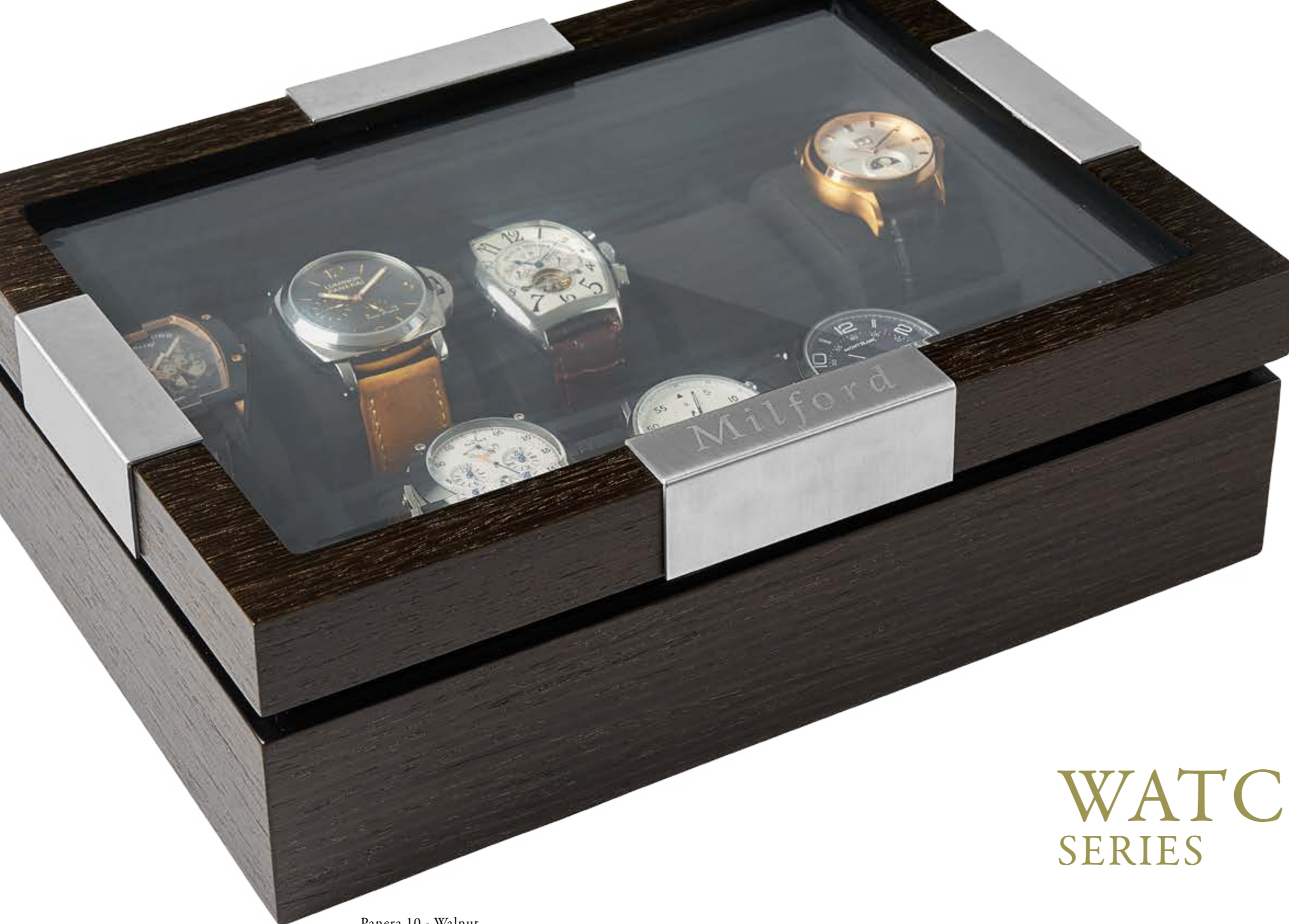
Panera 10 - Walnut