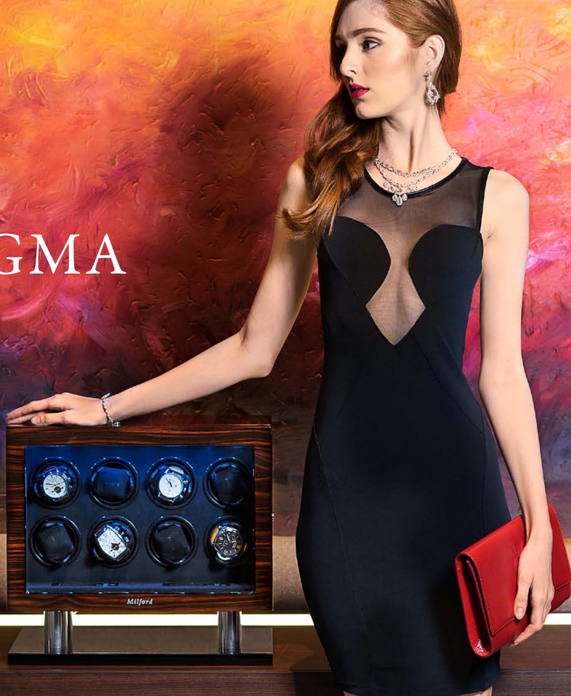
Milford Enigma 8 - Ebony