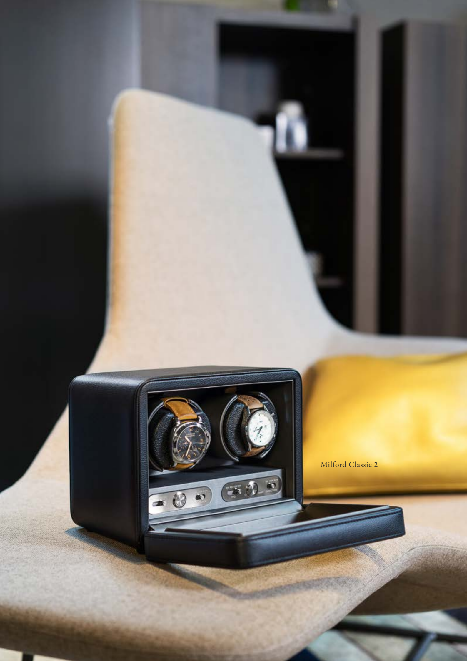
Milford Classic 2