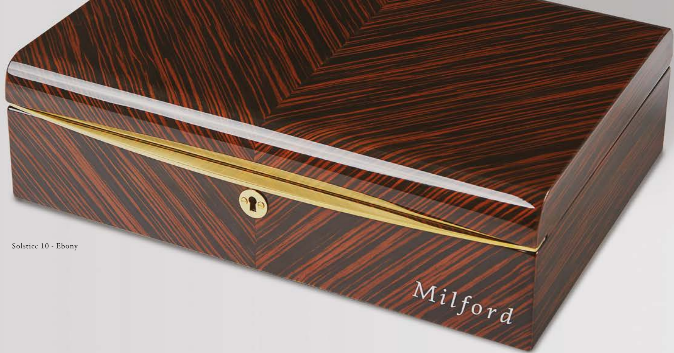
Solstice 10 - Ebony