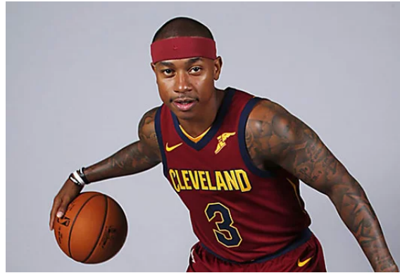
1 Trade Every NBA Team Wishes They Could Have Back The Sports Drop