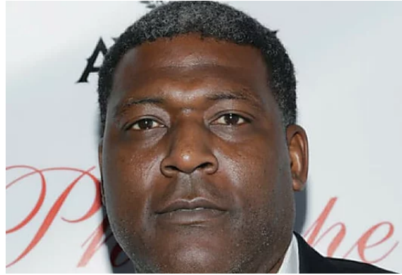
[Pics] NBA Legend Larry Johnson Just Confirmed What We Feared All Along Tie Breaker