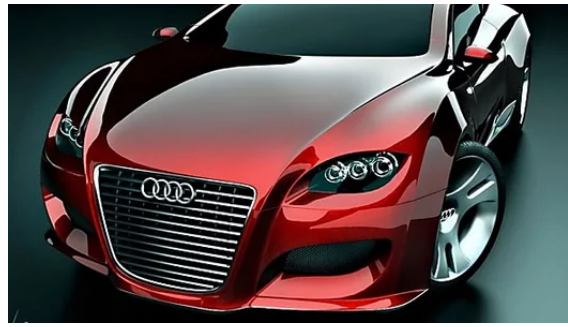
Incredible new 2018 Luxury Sedans Will Blow You Away Yahoo! Search

By using this site, you agree to the Privacy Policy and Terms of Use .