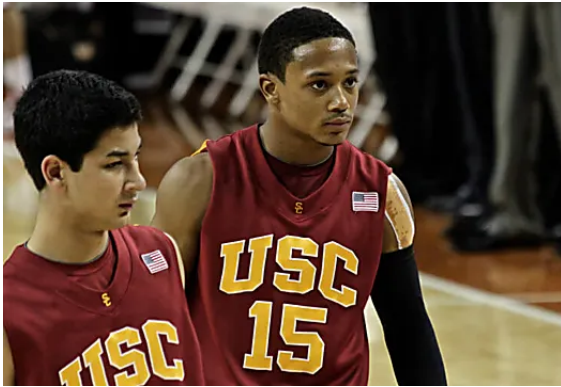
[Gallery] Actors You Never Knew Were Great Athletes Hooch