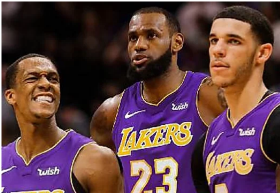
[Pics] LeBron's Teammates Ranked: Guess Where Lonzo Landed Simplemost