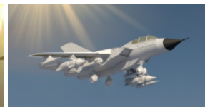
Play this Game for 1 Min