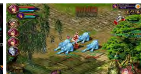
Myth War 2 Online