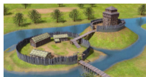
You should try this game