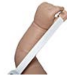
RD SET Inf thumb application