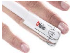
RD SET Adt finger application