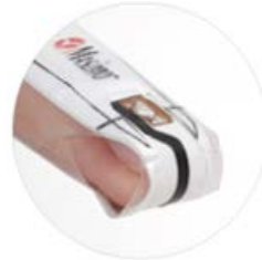
Tape removed for illustrative purposes