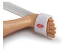
RD SET Inf foot application