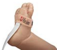
RD SET Inf foot application