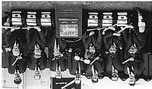
Drums of Black Bottle