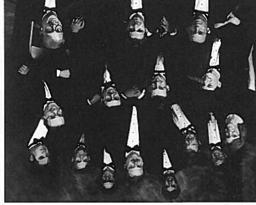
Southern Methodist University Percussion Ensemble