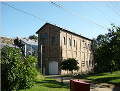
Folsom Powerhouse State Historic Park