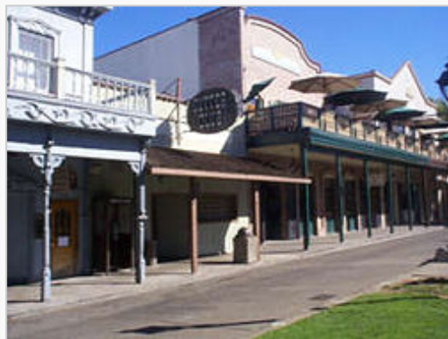
Historic Sutter Street

Coordinates: 38°42′12″N 121°19′39″W ﻿ / ﻿ 38.70333°N 121.32750°W ﻿ / 38.70333; -121.32750