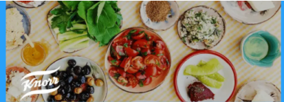
EX.CO Platform: Knorr Case Study