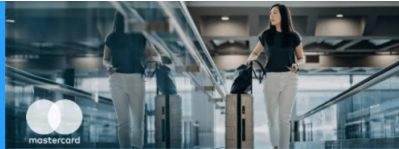
EX.CO Platform: Mastercard Case Study