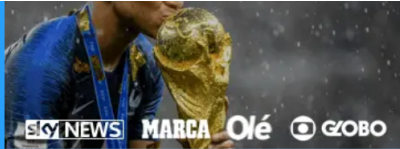
EX.CO Platform: World Cup Case Study