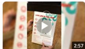
Unboxing - Aura Day Light Therapy Lamp S. D.