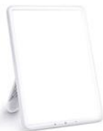
TaoTronics Light Therapy Lamp, Ultra-Thin UV-Free 10000 Lux Therapy Light, Timer Fu... ★★★★★ 2,054 $37.99 ✓prime