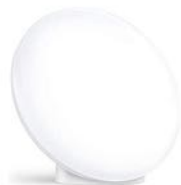
Light Therapy Lamp, TaoTronics UV-Free 10000 Lux Therapy Light, Touch Control with ... ★★★★★ 343 $39.99 ✓prime