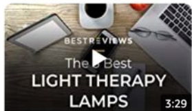
The 5 Best Light Therapy Lamps BestReviews