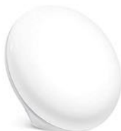
Miroco Light Therapy Lamp, UV-Free 10000 Lux LED Bright White Therapy Light, Touch ... ★★★★★ 3,236 $35.99 ✓prime