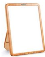
Miroco Light Therapy Lamp, UV-Free 10000 Lux LED Light, 90° Rotatable Standing Brac... ★★★★★ 394 $39.99 ✓prime