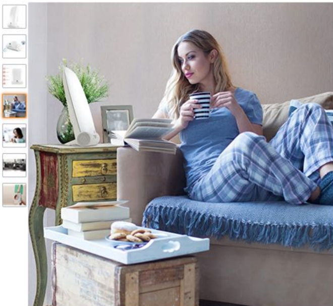
Roll over image to zoom in

Health & Household > Health Care > Alternative Medicine > Light Therapy