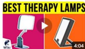
The 10 Best Therapy Lamps Ezvid Wiki