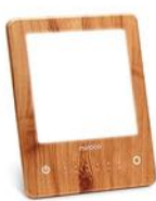
Miroco Light Therapy Lamp, LED Bright Therapy Light - UV Free 10000 Lux, Timer Func... ★★★★★ 581 $39.99 ✓prime