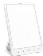
Light Therapy Lamp with Rechargeable Battery, Miroco Large 11inch Touch Control 100... ★★★★★ 159 $59.99 ✓prime