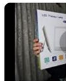
Are Light Therapy Lamps Worth It? Is It Worth It?