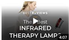
The 5 Best Infrared Therapy Lamps BestReviews