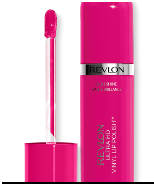
Revlon Ultra HD Vinyl Lip Polish™