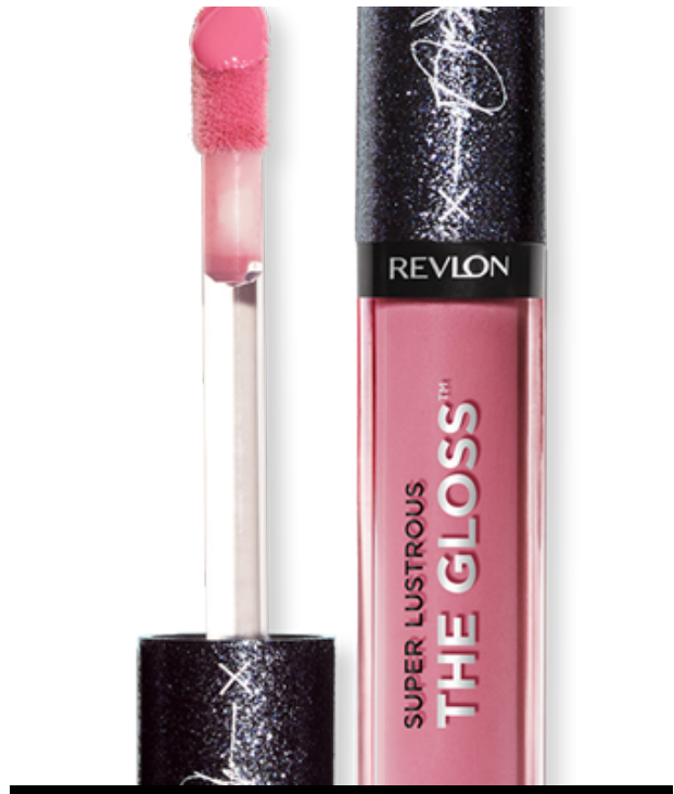
Ashley Graham Never Enough Lip Collection X Super Lustrous The Gloss