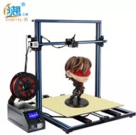
Creality 3D CR-10 5S large printing size 500x500x500... $500.00 - $999.00 1 Set (MOQ)