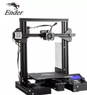
CREALITY 3D Ender-3 High Precision 3d printer diy kit... $135.00 - $229.00 1 Set (MOQ)