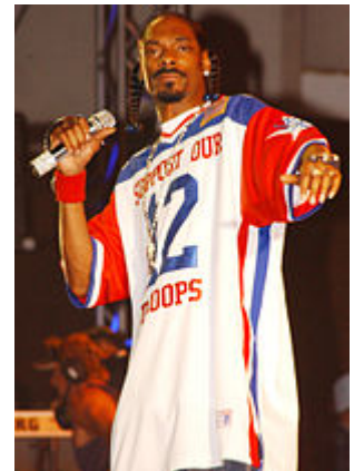
Snoop Dogg performs in Hawaii for U.S. military members in 2005

Snoop Dogg appeared on two tracks from Ice Cube's 2006 album Laugh Now, Cry Later , including " Go to Church ", and on several tracks on Tha Dogg Pound's Cali Iz Active the same year. His song "Real Talk" was leaked on the Internet in the summer of 2006 and a video was later released on the Internet. "Real Talk" was dedicated to former Crips leader Stanley "Tookie" Williams and a diss to Arnold Schwarzenegger , the governor of California. Two other singles on which Snoop made a guest performance were "Keep Bouncing" by Too $hort (also with will.i.am of the Black Eyed Peas ) and " Gangsta Walk " by Coolio .