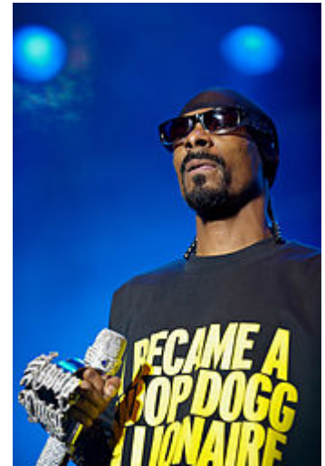
Snoop Dogg in August 2009

Since the start of his career, Snoop has been an avowed cannabis smoker, making it one of the trademarks of his image. In 2002, he announced he was giving up cannabis for good; [115] that did not last long (a situation famously referenced in the 2004 Adam Sandler movie 50 First Dates ) and in 2013, he claimed to be smoking approximately 80 cannabis blunts a day. [116] He has been certified for medical cannabis in California to treat migraines since at least 2007. [117][118][119]