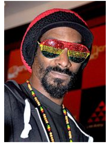
Snoop Dogg as Snoop Lion, 2013

In September of the same year, Snoop released a compilation of electronic music entitled Loose Joints under the moniker DJ Snoopadelic, stating the influence of George Clinton's Funkadelic. [40] In an interview with The Fader magazine, Snoop stated "Snoop Lion, Snoop Dogg, DJ Snoopadelic—they only know one thing: make music that's timeless and bangs." [40] In December 2012, Snoop released his second single from Reincarnated , "Here Comes the King". It was also announced that Snoop worked a deal with RCA Records to release Reincarnated in early 2013. [41] Also in December 2012, Snoop Dogg released a That's My Work a collaboration rap mixtape with Tha Dogg Pound. [42]