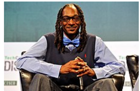
Snoop Dogg speaks onstage during day one of TechCrunch Disrupt SF 2015

Broadus made a special guest appearance in All Elite Wrestling on the January 6, 2021, episode of AEW Dynamite , titled New Year's Smash . [89] [90] During this appearance, Snoop appeared in the corner of Cody Rhodes during Rhodes' match with Matt Sydal . He later gave Serpentico a Frog