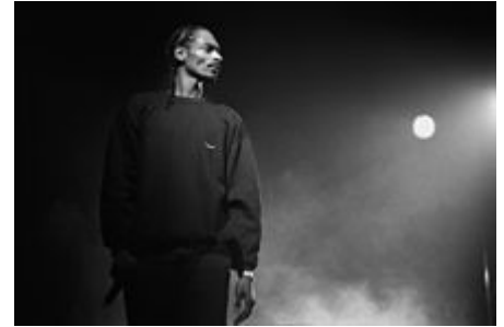
Snoop Dogg in 1998

Fueling the ascendance of West Coast G-funk hip hop , the singles " Who Am I (What's My Name)? " and " Gin and Juice " reached the top ten most-played songs in the United States, and the album stayed on the Billboard charts for several months. [13] Gangsta rap became the center of arguments about censorship and labeling, with Snoop Dogg often used as an example of violent and misogynistic musicians . [20] Unlike much of the harder-edged gangsta rap artists, Snoop Dogg seemed to show his softer side, according to music journalist Chuck Philips . Rolling Stone music critic Touré asserted that Snoop had a relatively soft vocal delivery compared to other rappers: "Snoop's vocal style is part of what distinguishes him: where many rappers scream, figuratively and literally, he speaks softly." [15] Doggystyle , much like The Chronic , featured a host of rappers signed to or affiliated with the Death Row label including Daz Dillinger , Kurupt , Nate Dogg , and others.