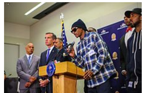
Snoop Dogg and Los Angeles Mayor Eric Garcetti speaking at a press conference following the 2016 shooting of Dallas police officers

In his keynote address at the 2015 South by Southwest music festival, he blamed Los Angeles's explosion of gang violence in the 1980s on the economic policies of Ronald Reagan , and insinuated that his administration shipped guns and drugs into the area. [156]