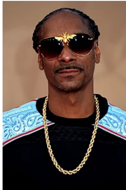
Snoop Dogg in 2019