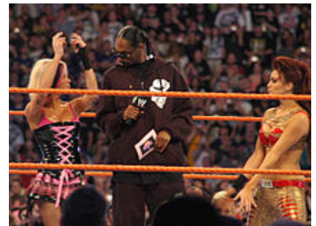
Snoop Dogg at WrestleMania XXIV at Orlando's Citrus Bowl with Ashley Massaro and tag team partner Maria , March 30, 2008

In 2000, Broadus (as "Michael J. Corleone") directed Snoop Dogg's Doggystyle , a pornographic film produced by Hustler . The film, combining hip hop with x-rated material, was a huge success and won "Top Selling Release of the Year" at the 2002 AVN Awards . [72] Snoop then directed Snoop Dogg's Hustlaz: Diary of a Pimp in 2002 (using the nickname "Snoop Scorsese"). [73]