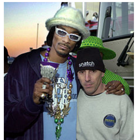
Snoop Dogg (left) with Maynard James Keenan in 2001

By the time Snoop Dogg's second album, Tha Doggfather , was released in November 1996, the price of appearing to live the gangsta life had become very evident. Among the many notable hip hop industry deaths and convictions were the death of Snoop Dogg's friend and labelmate Tupac Shakur and the racketeering indictment of Death Row co-founder Suge Knight . [13] Dr. Dre had left Death Row earlier in 1996 because of a contract dispute, so Snoop Dogg co-produced Tha Doggfather with Daz Dillinger and DJ Pooh .