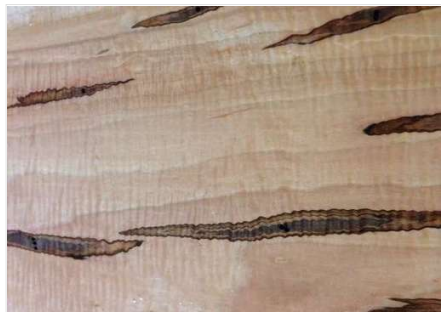
ery Rare and Beautiful Curly Ambrosia Maple

Our customers range from homeowners, carpenters, cabinet and furniture makers, professional musical instrument makers, wood carvers, to folks who just want to build a doghouse or front porch bench. We put a lot of effort into providing top quality hardwood lumber and are very proud of the