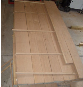
Quality White Oak Kiln Dried FAS Select

In the end, what do you get out of it? What are we trying to sell you? First class lumber that fits your needs! Looks at the pictures below, and try to imagine how good you would feel building projects from wood like this. When is the last time you've seen 17 inch wide oak or cherry boards? Without a knot? Klin dried? Flat as a pancake? Or when was the last time you and your kids could share a woodworking project without having to worry about missing a cut because the wood you bought retail was so expensive? Some of my mill run project wood is so inexpensive you can just have fun and not worry about it.