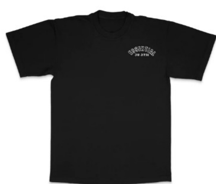
ESSENTIAL JIU JITSU WAVY ARC $30.00