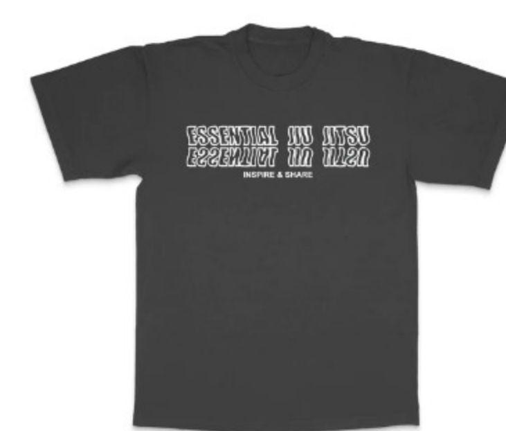
ESSENTIAL JIU JITSU REFLECTED T SHIRT $30.00