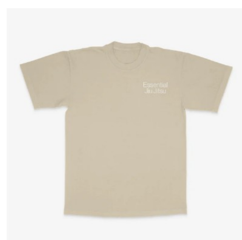
INSPIRE AND SHARE SHOP T-SHIRT $30.00