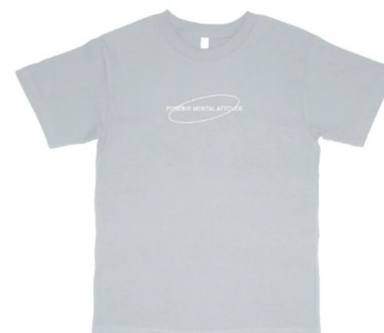
PMA RING T-SHIRT $30.00