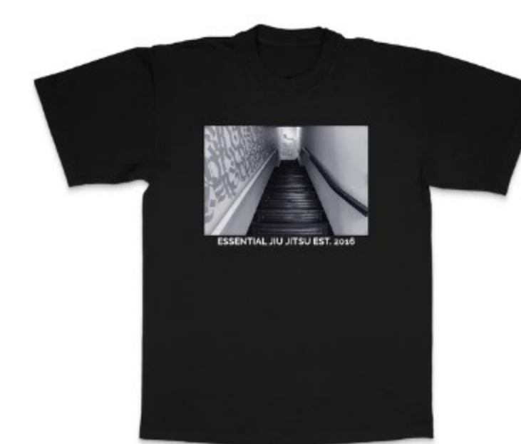
ESSENTIAL JIU JITSU OLD SCHOOL STAIRS T SHIRT $30.00