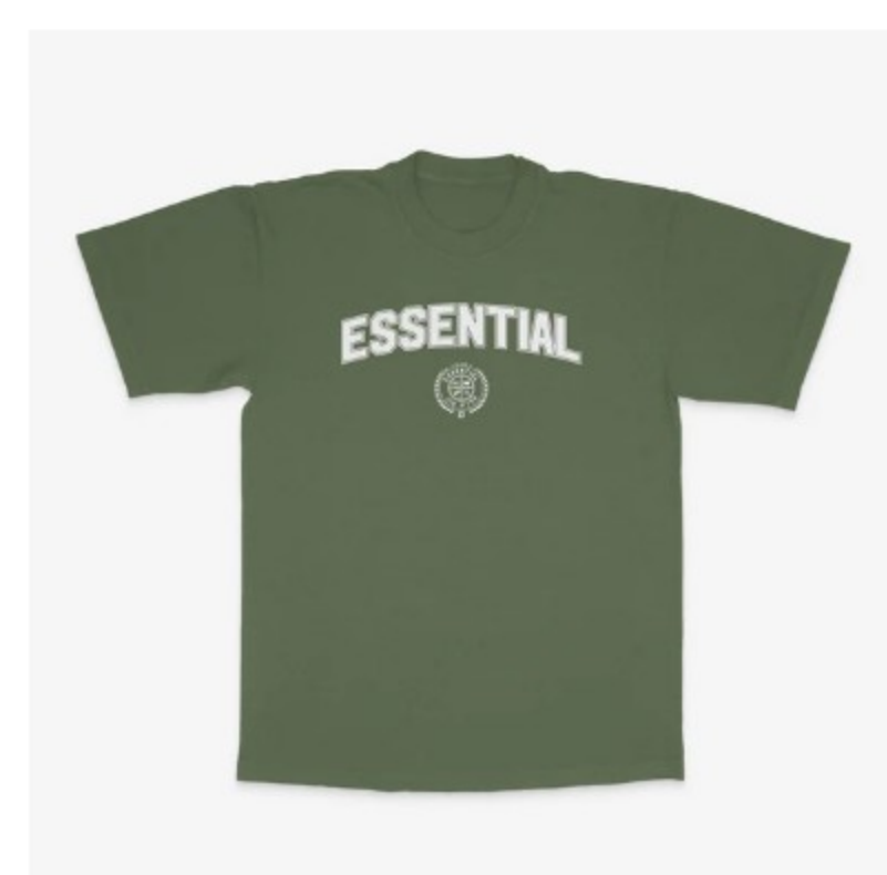
ESSENTIAL UNIVERSITY CREST T-SHIRT $30.00