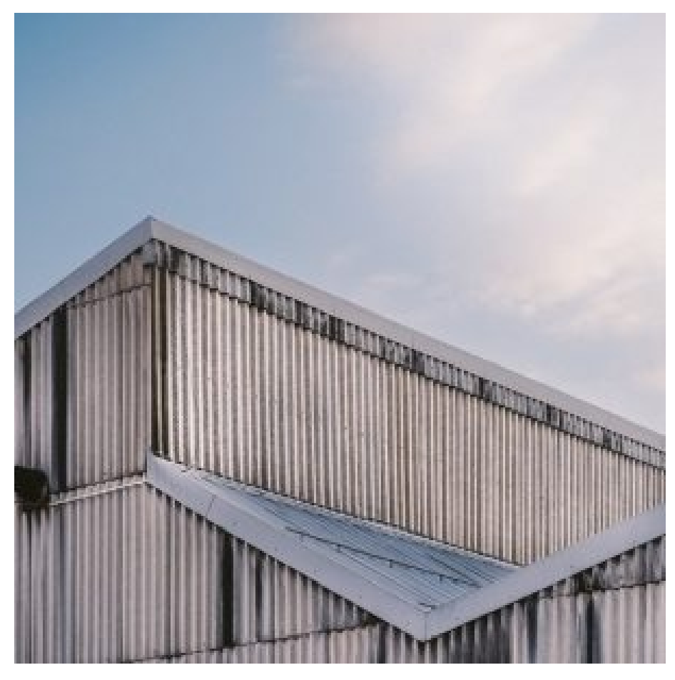
NORLUND Import-export agency service