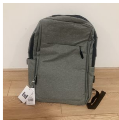
Vintage Laptop Backpack for Women Men,School College Backpack , School bags