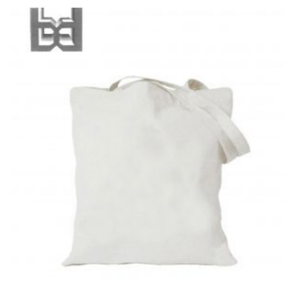
reusable shopping bags