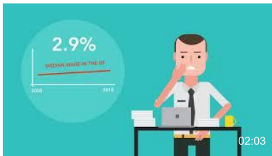
Why Investing In America matters