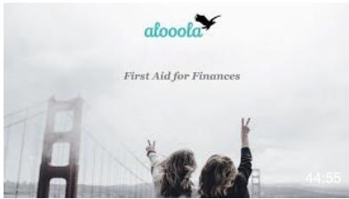
First Aid For Finances, presented by alooola