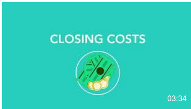
Buying a Home