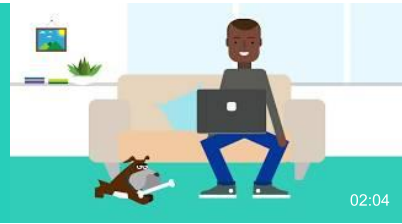
Why not all debt is bad