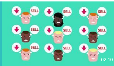
Controlling Emotions When Investing