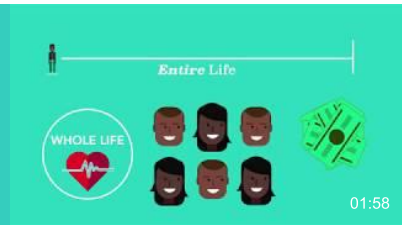
Understanding Life Insurance