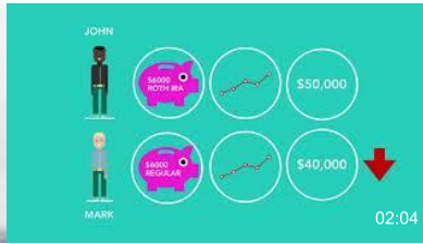
What is a Roth IRA?