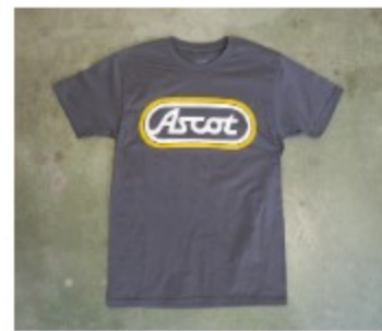
Track Logo - gray $ 30.00