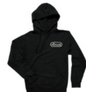
Ascot Hoodie - Black $ 60.00