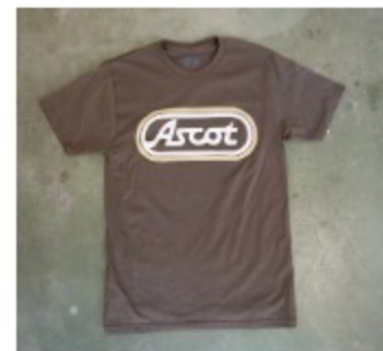
Track Logo Army Ascot $ 30.00