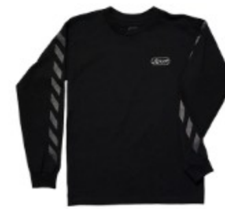
CRASH WALL LONG SLEEVE T-SHIRT (W) $ 39.95