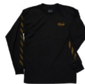
CRASH WALL LONG SLEEVE T-SHIRT (Y) $ 39.95