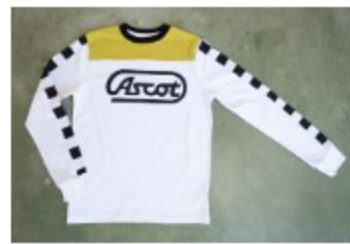
Race Jersey $ 40.00