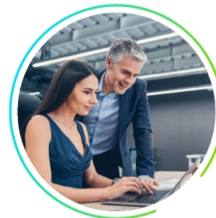
Sales & Marketing