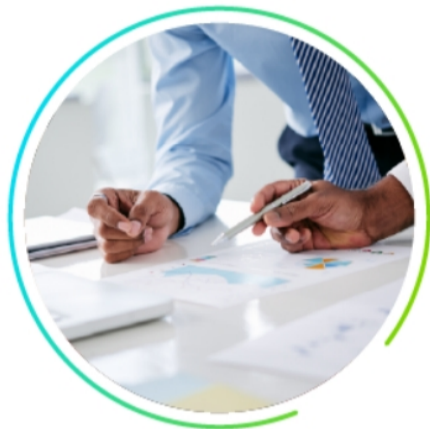
Financial Services & Insurance