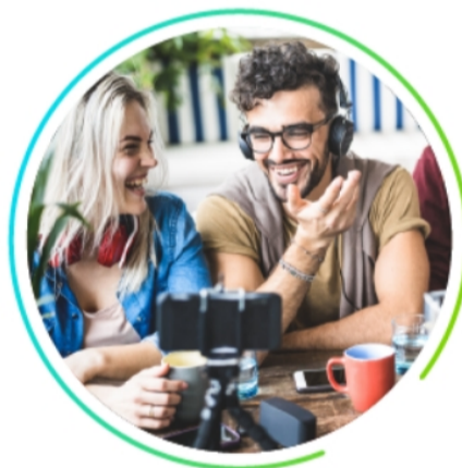
Advertising, Media & Publishing