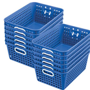
Pharmacy Supplies >