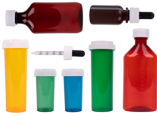
Vials and Ovals >