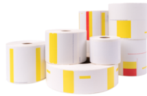
Pharmacy Labels >