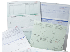
Governmental Forms >