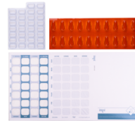
Prescription Packaging >