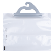
Pharmacy Retrieval Supply >