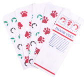
Veterinary Supplies >