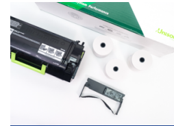
Printer Supplies >