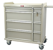
Medication Carts >