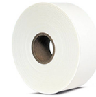
Strip Pouch Packaging >