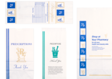
Pharmacy Bags >