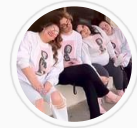
JW Beauty ...