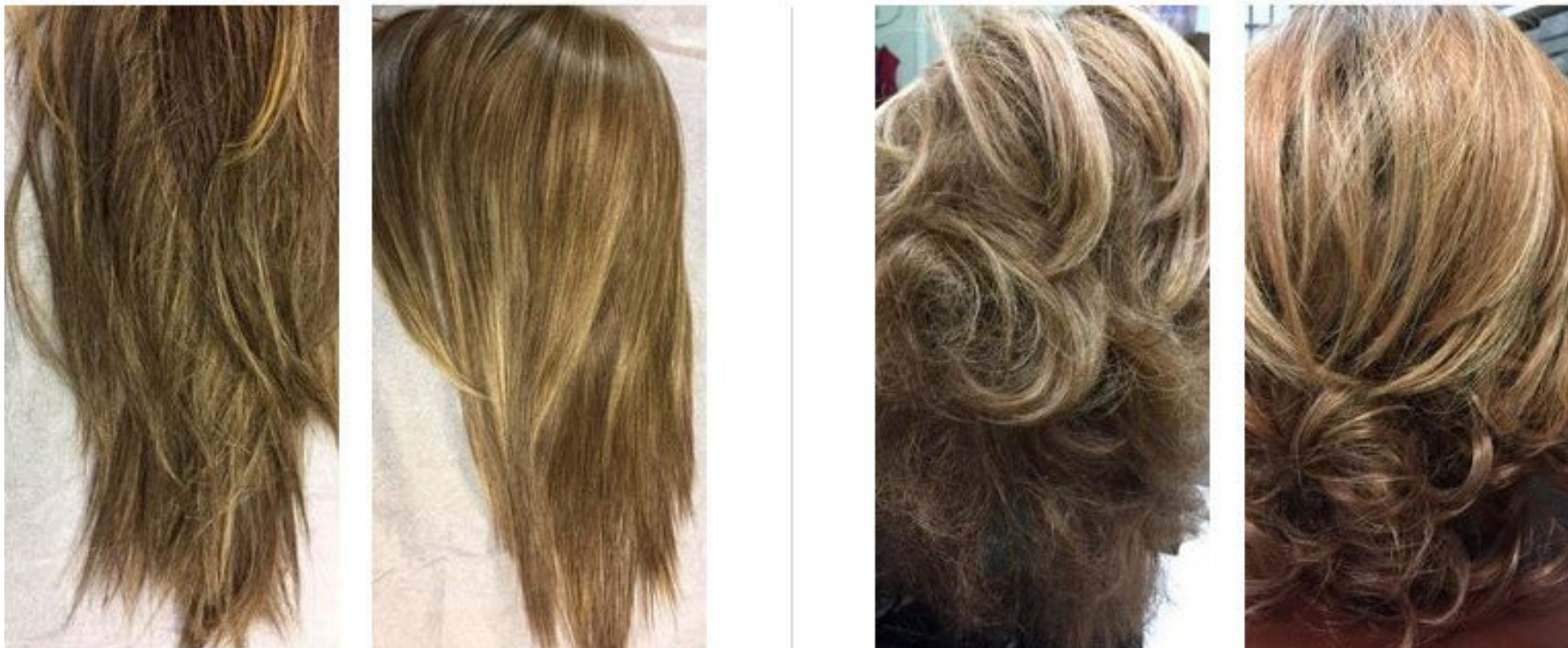
Before & After Photos of both Straight & Curly Hair Wigs.