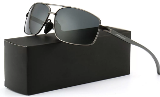
LIFANGDIAN Ultra Light Rectangular Polarized Sunglasses UV400 Protection $25.99