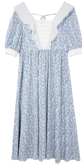
KUSIMLE Summer Organza Square Neck Floral Skirt Neck Waist Mid Sleeve Dress Swing Skirt, $39.99